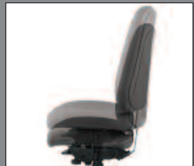
A heavy-duty pneumatic cylinder raises and lowers the seat height anywhere from 18-23".