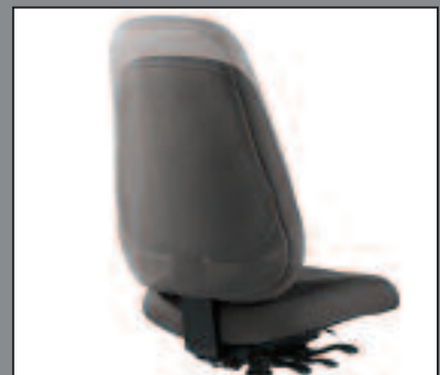
Pilot's back height can be manually adjusted over a 4" range, putting lumbar support right where you need it.