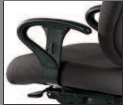
Adjustable loop arms can be adjusted 2.5" in height for maximum comfort.