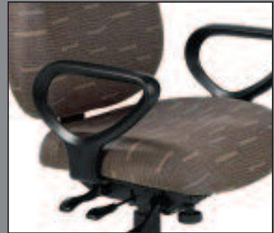
Fixed loop arms give Pilot a traditional task chair look and feel.

With so many ways to make Pilot your own, the only question is where do you want yours to take you?